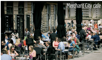
Merchant City cafe