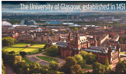
The University of Glasgow, established in 1451

For trips outside of Glasgow, the train and bus systems are very efficient options. Within an hour by public transportation, visitors can explore beautiful Edinburgh or Loch Lomond. Those with a sporty flair can spend time at one of over 60 golf courses within a 30-minute trip of the city centre. And for more intrepid travellers with a day to spare before or after the Congress, frequent bus tours go to some of Scotland's most famous sites, including mysterious Loch Ness!