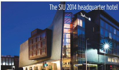
The SIU 2014 headquarter hotel